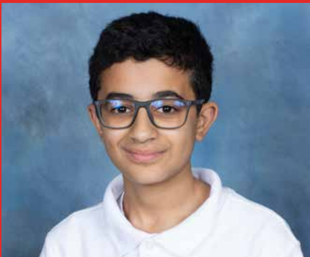
Ecology, 3rd Place & Office of Naval Research