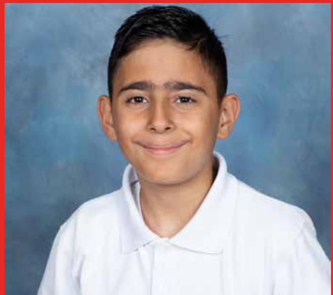
Professional Engineers in California Government