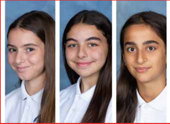
Chemistry, 1st Place