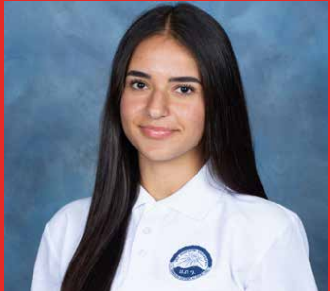
Saban Family Foundation & Product Science, Honorable Mention