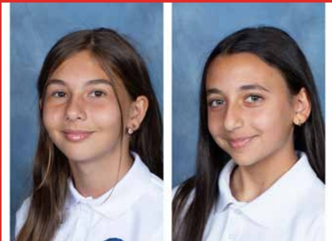
Physics – Electricity and Magnetism, 3rd Place